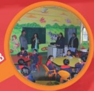
SOC. SCIENCE LAB

To know social - science generalization & social connections.